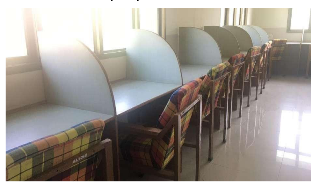
Separate reading are for staff in the library