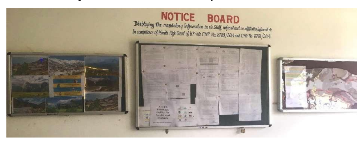
Notice board for staff and students