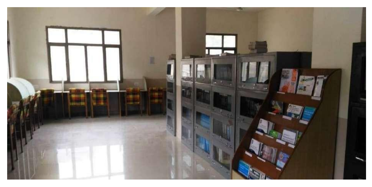
Library facility for the staff and students

(NAAC B<sup>++</sup> Accredited and ISO 9001:2015 Certified Institute)