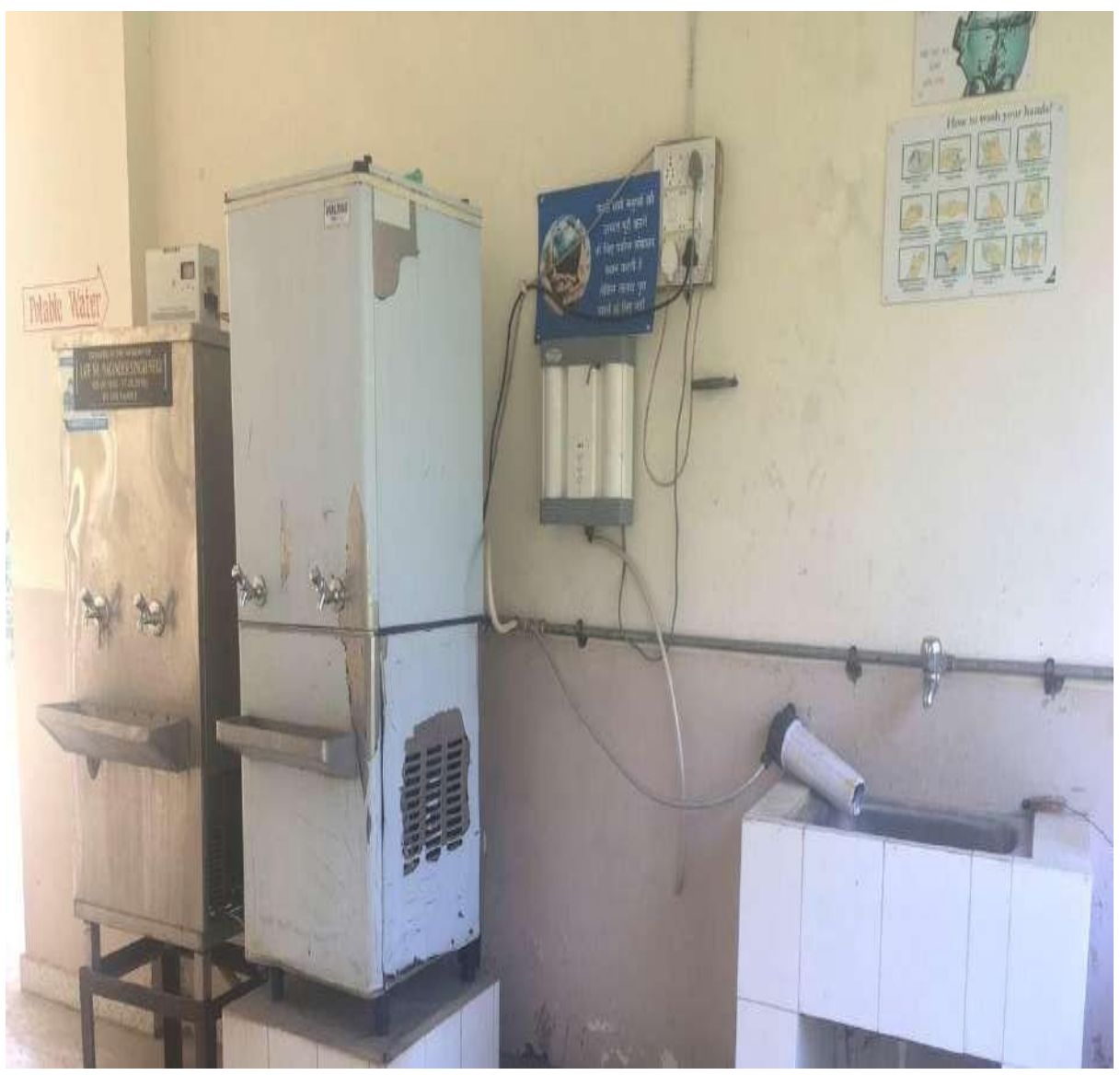
Cold RO water and washing area facility for staff and students

Recognized by PCI; Approved by AICTE, New Delhi; Affiliated to HPTU, Hamirpur Ph. No. 01781 - 241306; E-mail: <a href="mailto:gcprohru@gmail.com">gcprohru@gmail.com</a>; web: <a href="mailto:www.gcprohru.ac.in">www.gcprohru.ac.in</a>