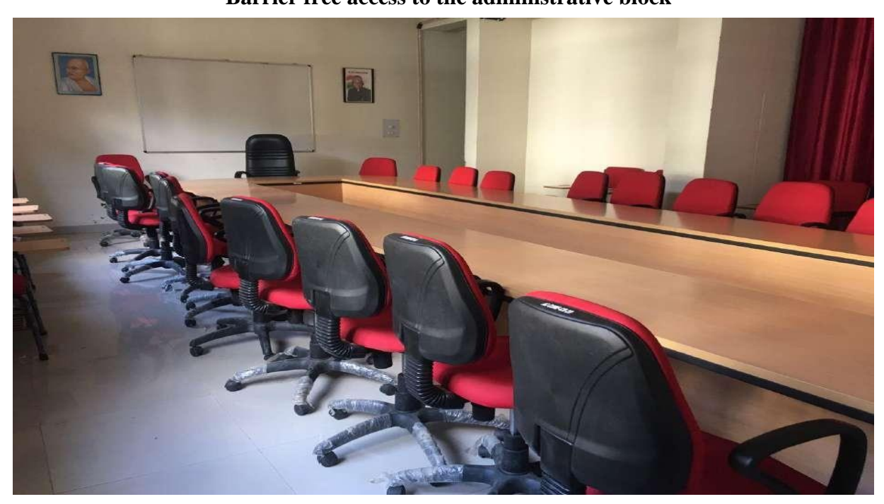
Conference room for staff meeting and students presentation