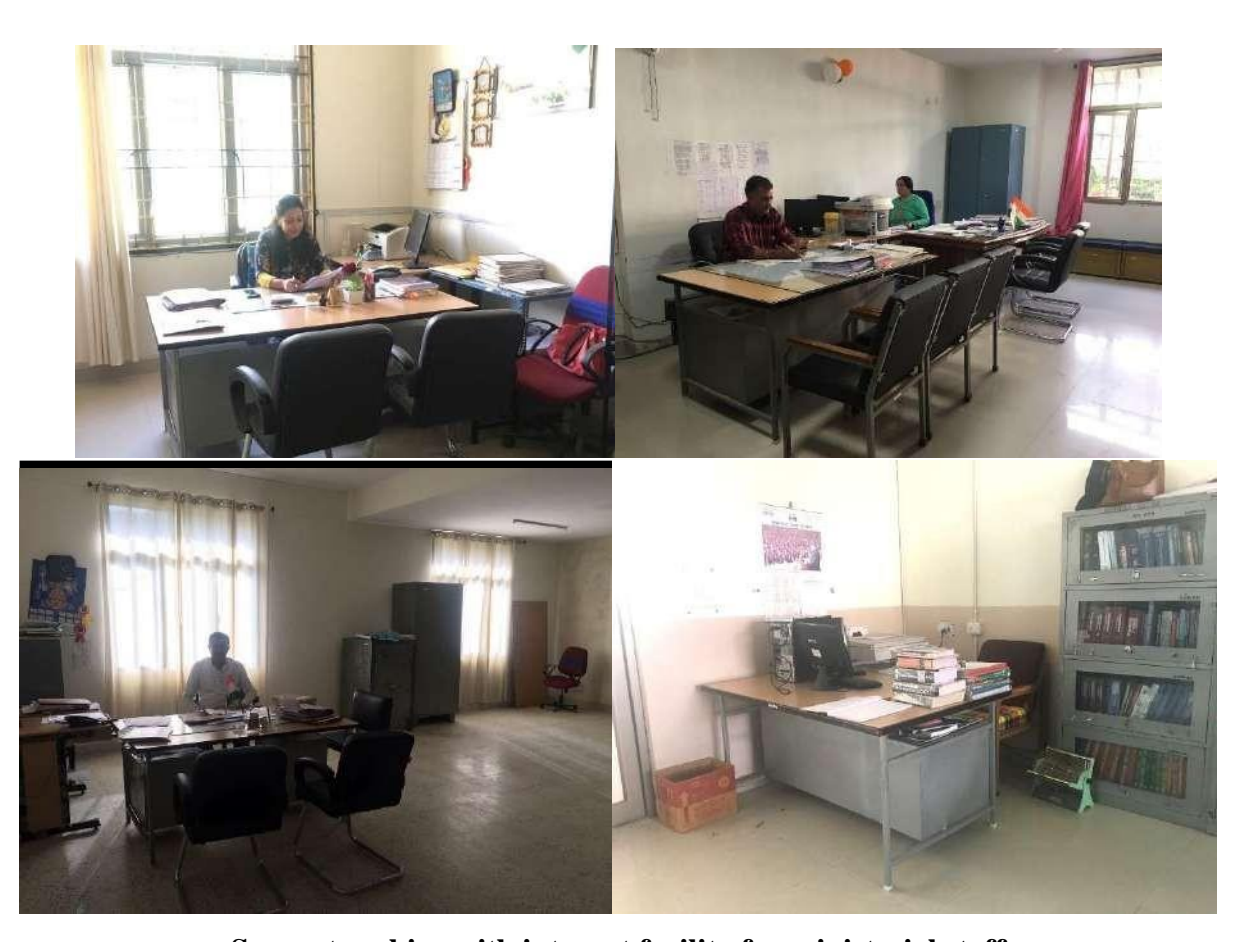
Separate cabins with internet facility for ministerial staff

(NAAC B<sup>++</sup> Accredited and ISO 9001:2015 Certified Institute)