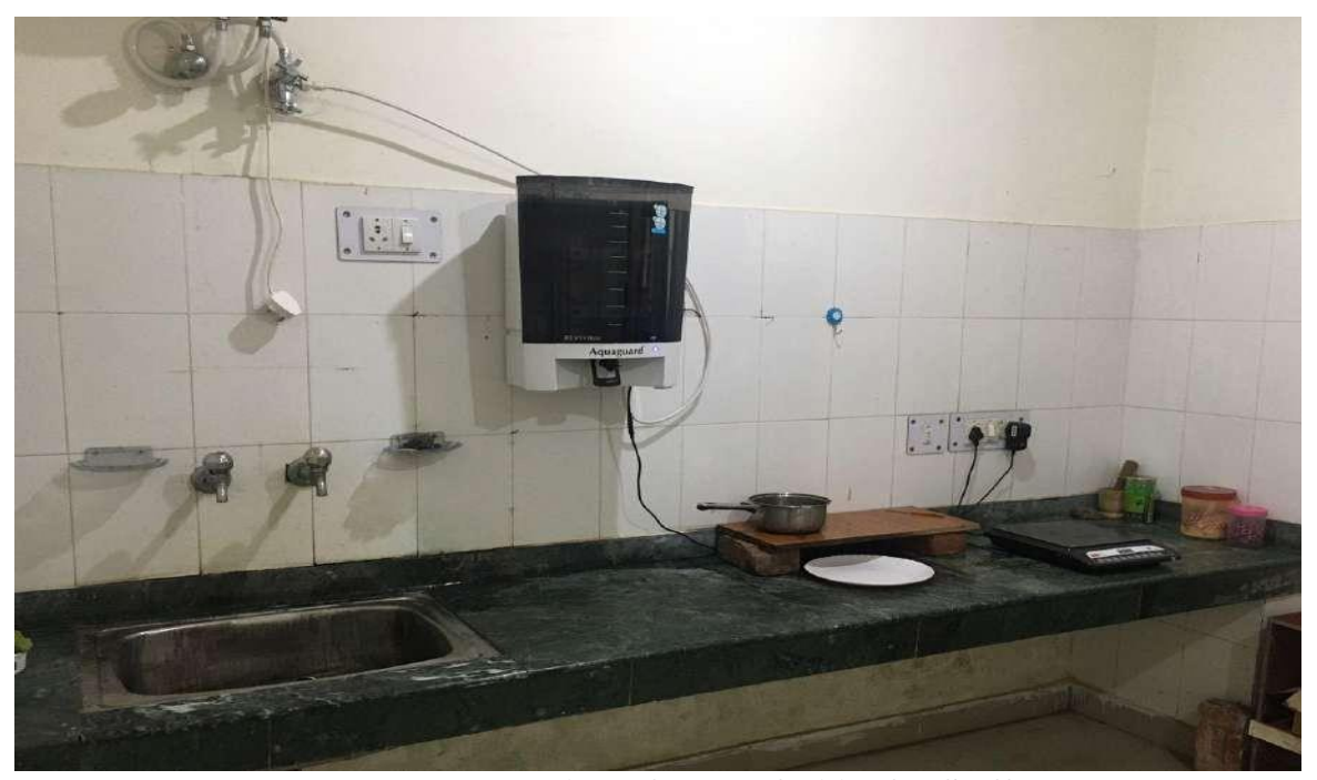
Pantry along with RO water facility for Staff

(NAAC B<sup>++</sup> Accredited and ISO 9001:2015 Certified Institute)