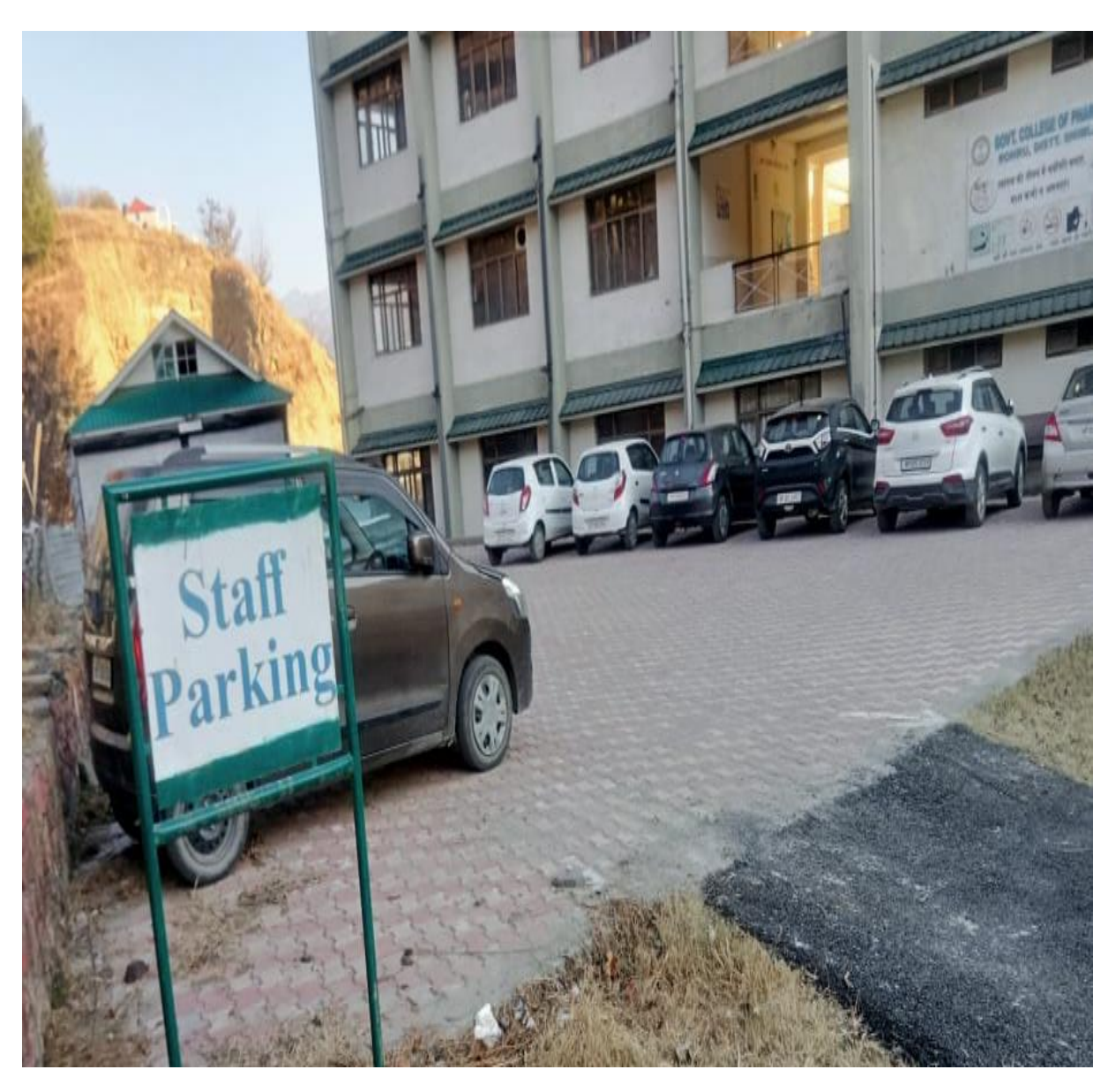
Parking Facility for Staff and Students

(NAAC B<sup>++</sup> Accredited and ISO 9001:2015 Certified Institute)