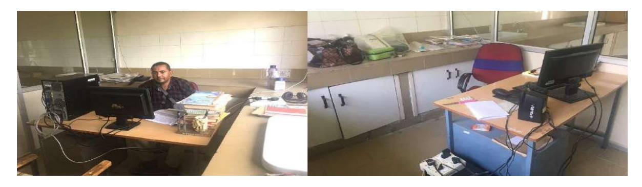
Separate cabins with internet facility for non-teaching staff