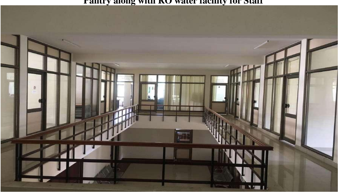
Separate cabins for the Teaching staff