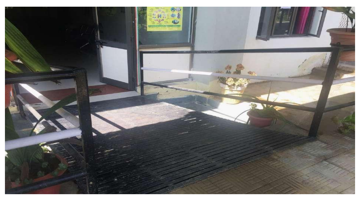
Barrier free access to the administrative block

Recognized by PCI; Approved by AICTE, New Delhi; Affiliated to HPTU, Hamirpur Ph. No. 01781 - 241306; E-mail: gcprohru@gmail.com; web: www.gcprohru.ac.in