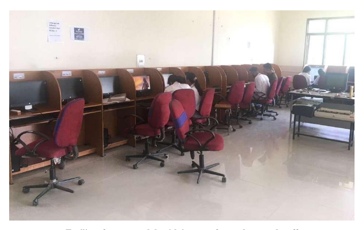
Facility of computer lab with internet for students and staff

Recognized by PCI; Approved by AICTE, New Delhi; Affiliated to HPTU, Hamirpur Ph. No. 01781 - 241306; E-mail: gcprohru@gmail.com; web: www.gcprohru.ac.in