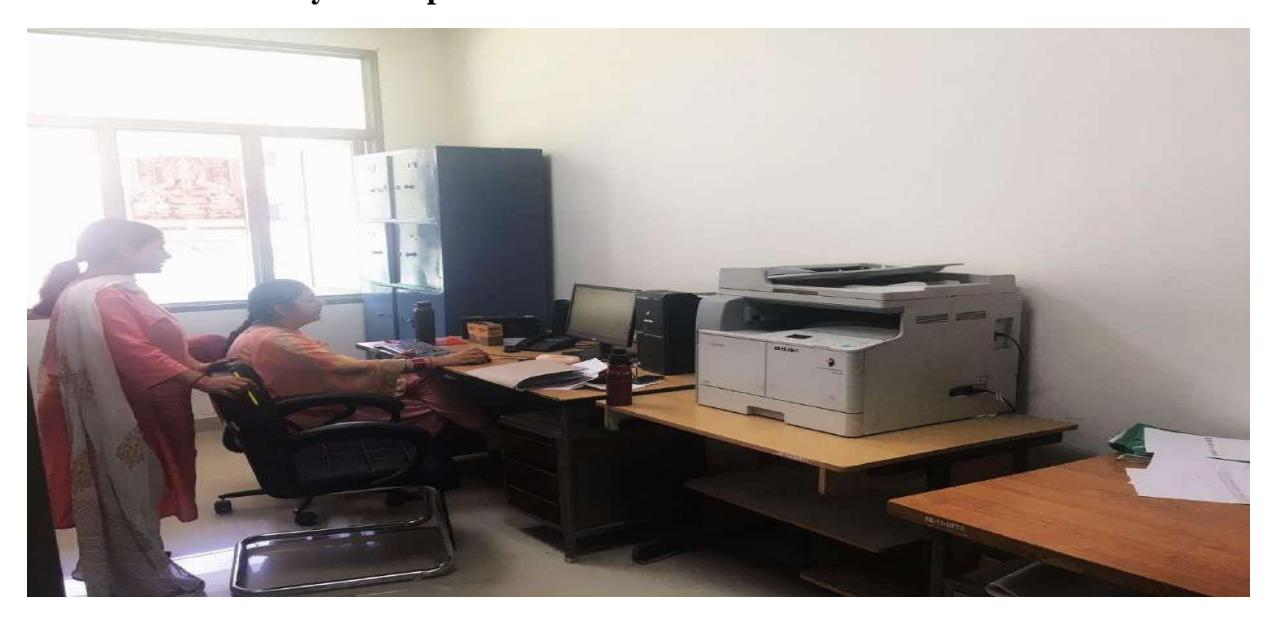
Printer, scanner and internet facility for staf