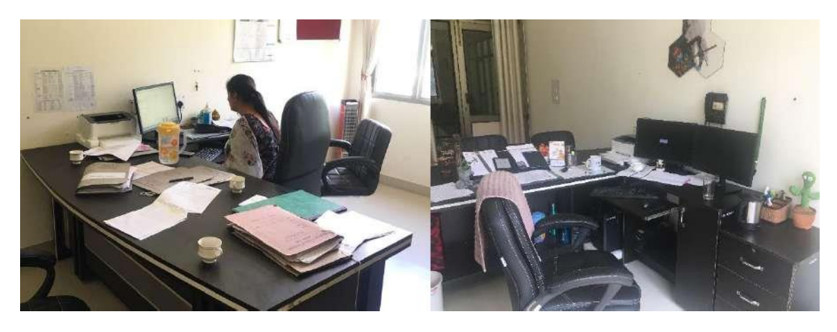
Separate faculty cabins for Assistant Professors

Recognized by PCI; Approved by AICTE, New Delhi; Affiliated to HPTU, Hamirpur Ph. No. 01781 - 241306; E-mail: gcprohru@gmail.com; web: www.gcprohru.ac.in