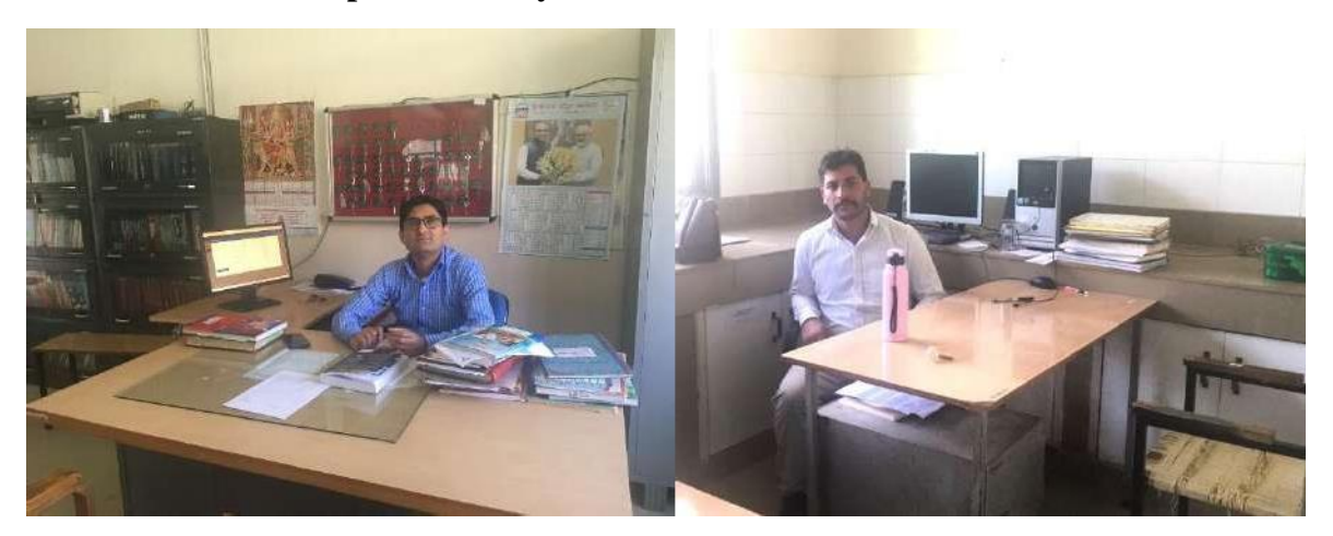
Separate cabins with internet facility for non-teaching staff