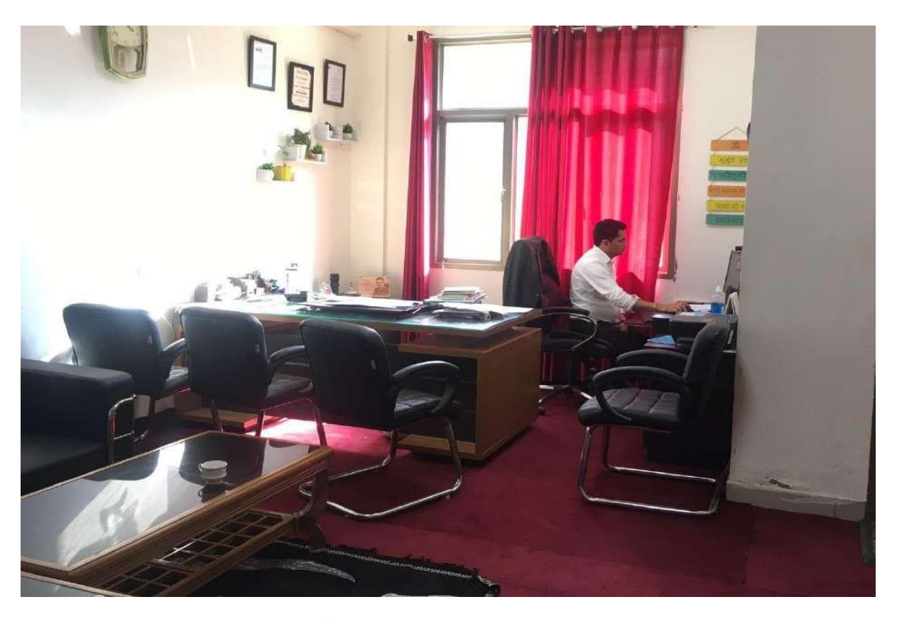
Separate Professor's cabin

(NAAC B<sup>++</sup> Accredited and ISO 9001:2015 Certified Institute)