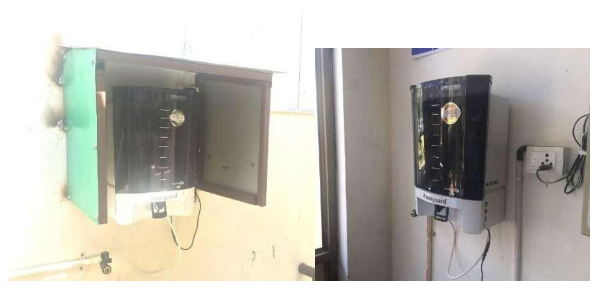
Clean and freely accessible RO water facility for staff and students

Recognized by PCI; Approved by AICTE, New Delhi; Affiliated to HPTU, Hamirpur Ph. No. 01781 - 241306; E-mail: <a href="mailto:gcprohru@gmail.com">gcprohru@gmail.com</a>; web: <a href="www.gcprohru.ac.in">www.gcprohru.ac.in</a>